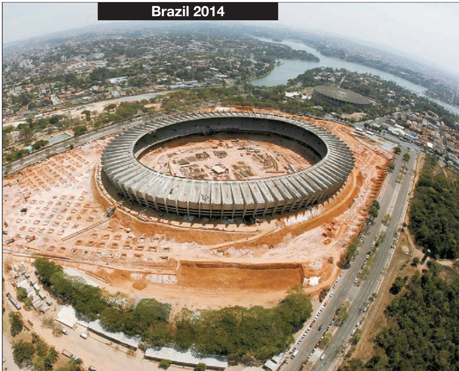
An aerial view shows the renovation work at Magalhaes Pinto soccer stadium, also known as Minerao stadium, that will be used in the 2014 FIFA World Cup in Brazil.