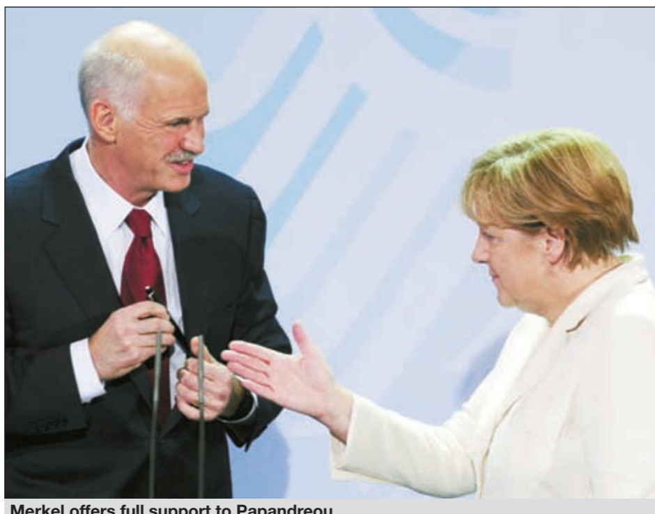
Merkel offers full support to Papandreu

Only France let slip signs of a new plan to end the crisis, with Prime Minister Francois Fillon saying any announcement would be made after Germany's parliament approves boosting the eurozone rescue