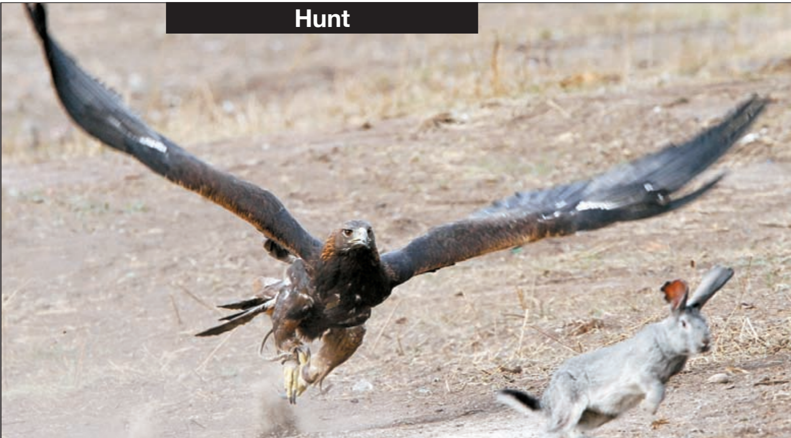
A hunting bird chases its prey, a hare, during a festival of traditional sports in the East Kazakhstan's city of Ust-Kamenogorsk.